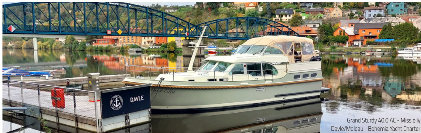
Grand Sturdy 40.0 AC - Miss elly Davle/Moldau - Bohemia Yacht Charter

Included in rental price : VAT, Beds made upon arrival, towels, (1 set/person/week, secured parking for your car, gas consumption, 1hr. Sailing instruction.